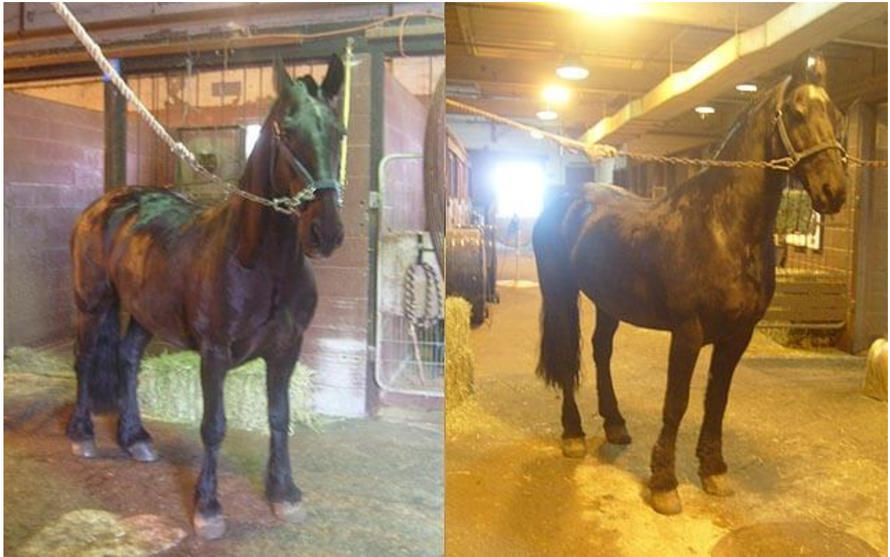
Nimo and Bas