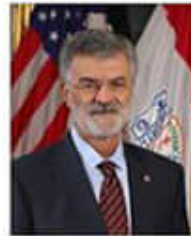
Frank G. Jackson Mayor

5 - 7 p.m. Collinwood Rec Center 16300 Lakeshore Blvd.