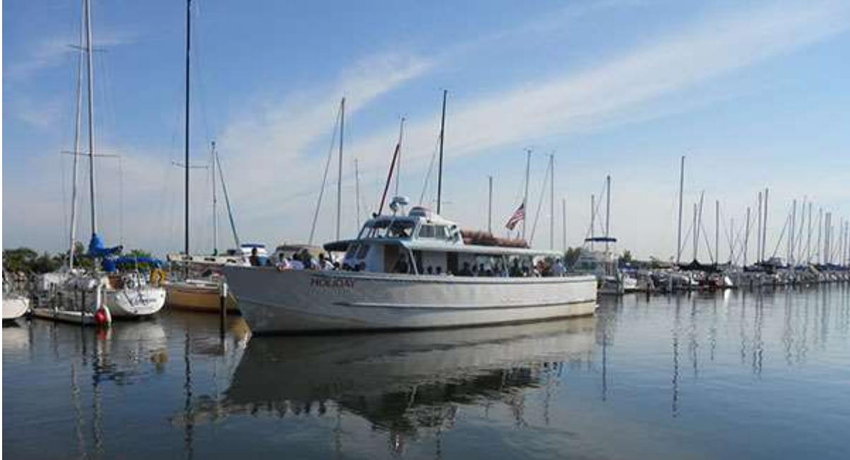
The 65 foot Holiday reverses engine to head out with the kids and officers