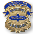
Lapel Pin (actual size 1.25" x 1.125")

Please make $ _____ a recurring gift through _____ Year