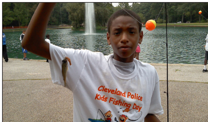
Got the first catch of the day, albeit a small one.