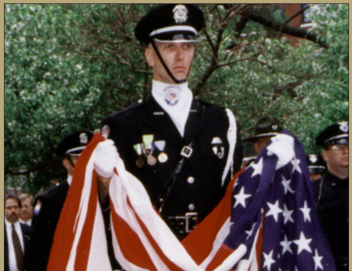
Members of the Whitehall PD Honor Guard participate in the Greater Cleveland Peace Officer Memorial Service.

Opportunities exist in a wide range of options for your business or organization to partner with the